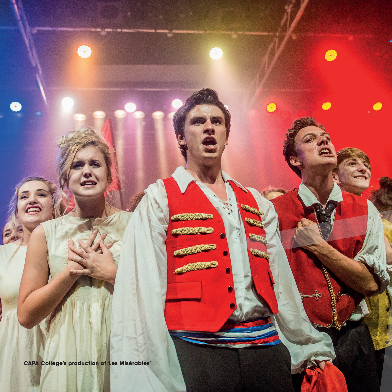
CAPA College's production of 'Les Misérables'