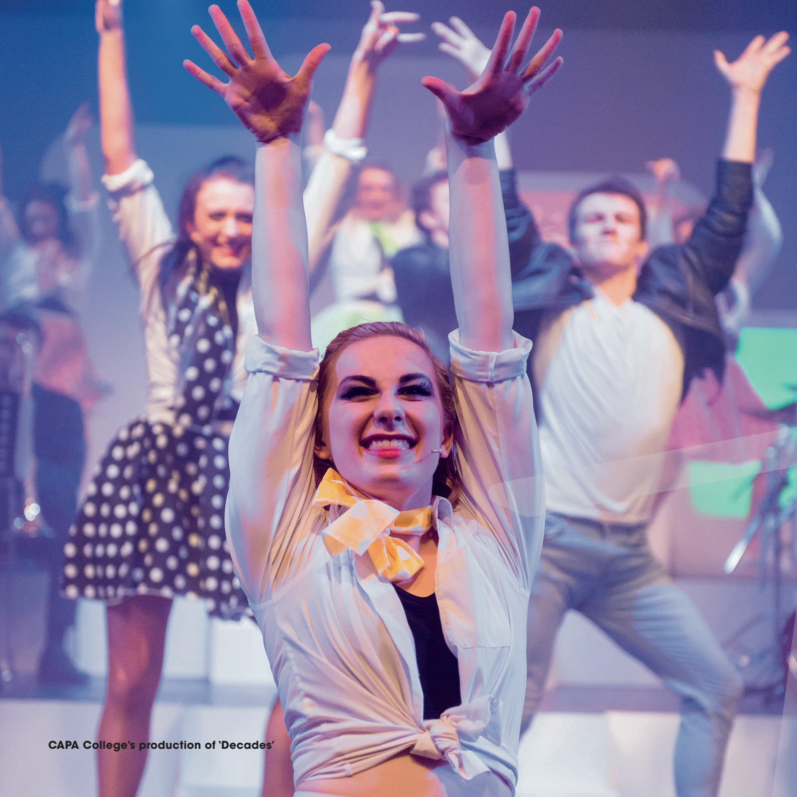
CAPA College's production of 'Decades'