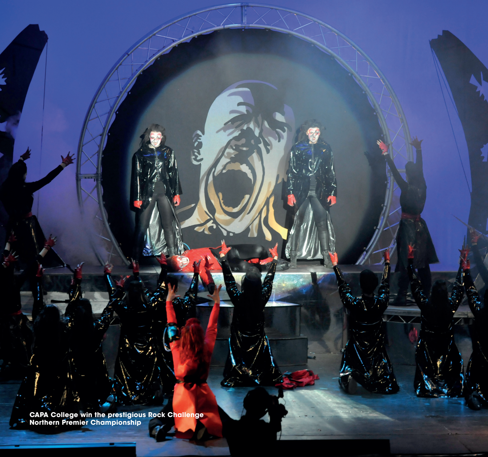
CAPA College win the prestigious Rock Challenge Northern Premier Championship