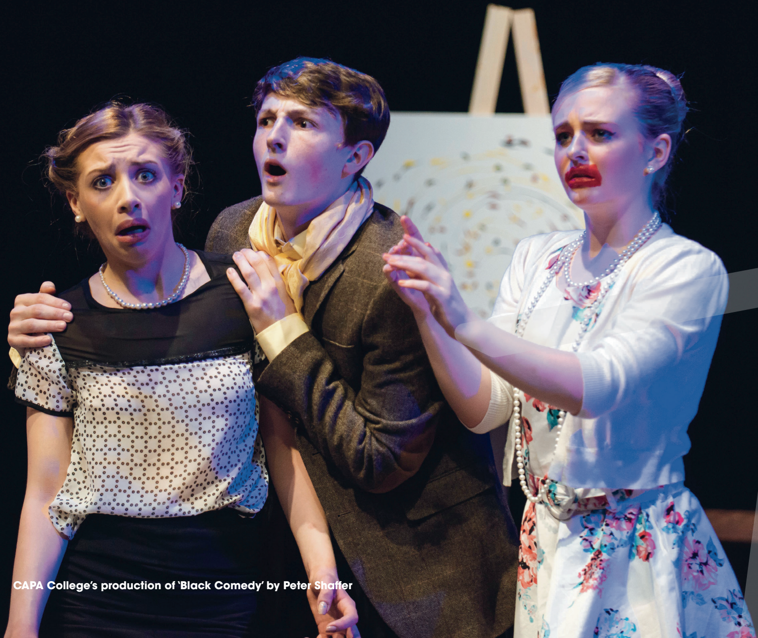
CAPA College's production of 'Black Comedy' by Peter Shaffer