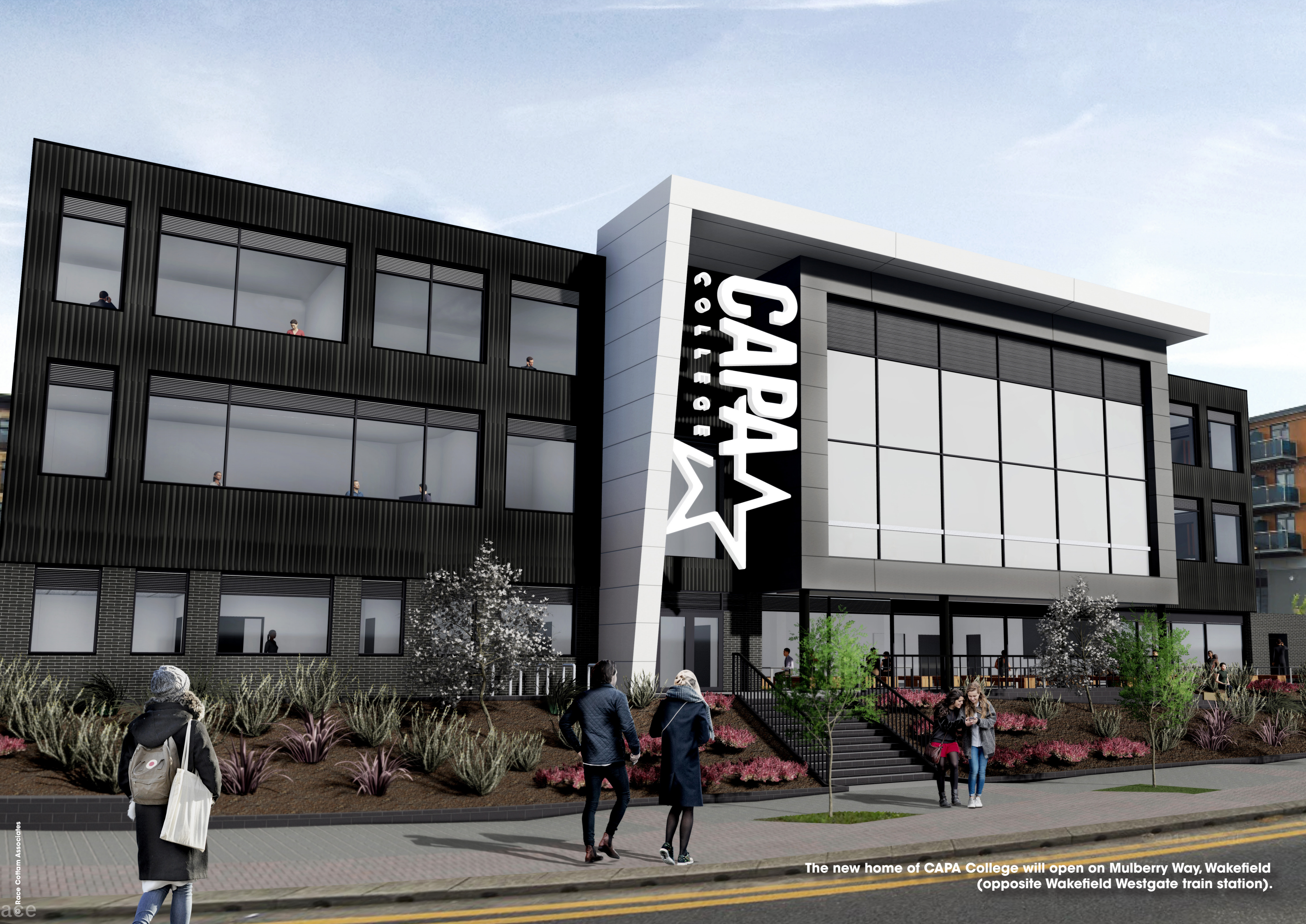
The new home of CAPA College will open on Mulberry Way, Wakefield (opposite Wakefield Westgate train station).