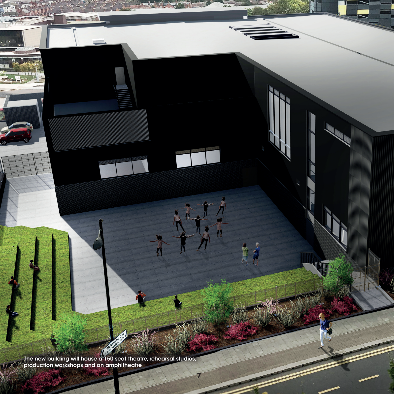
The new building will house a 150 seat theatre, rehearsal studios, production workshops and an amphitheatre